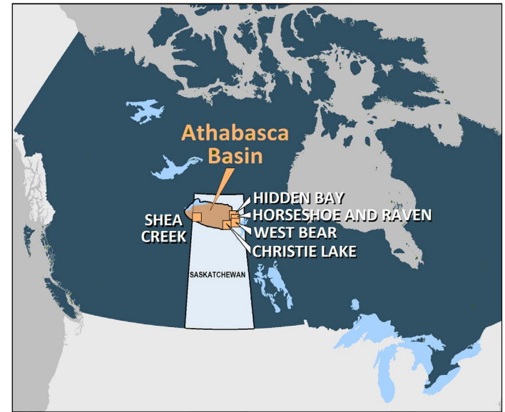
Figure 1 – Athabasca Basin

Athabasca Basin uranium deposits are classified as unconformity-type deposits. They are developed at, and below, the unconformity at the base of the shallow-dipping, Proterozoic Athabasca sandstone, either at its contact with the underlying metamorphosed gneiss sequence, or within the gneiss up to a distance of 800 metres (m) below the unconformity. Both of these styles of mineralization are frequently associated with graphitic gneiss units in basement rocks and faults associated with these which together form lithologies, conductive, geophysical anomalies that can be traced using electromagnetic surveys.